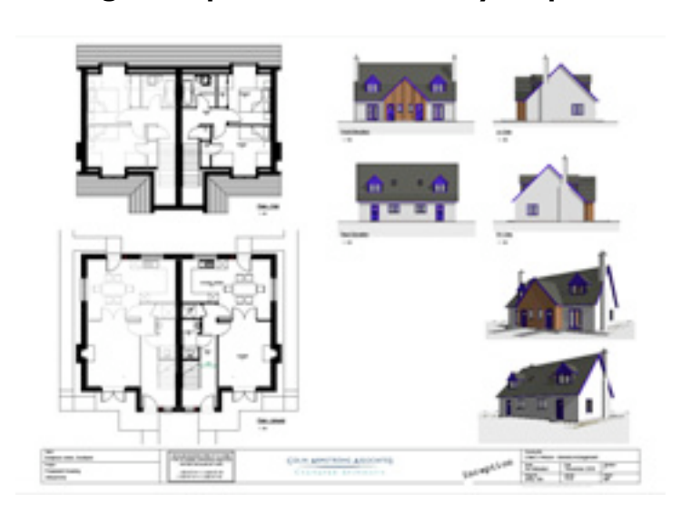
Fig. 9 Proposed staff accommodation two x two apartments revised proposal