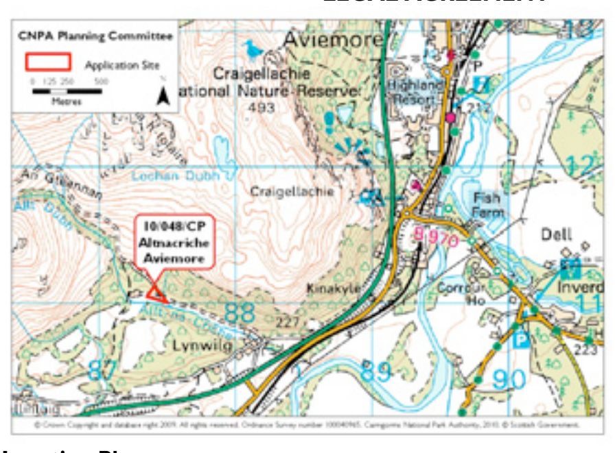
Fig. I - Location Plan