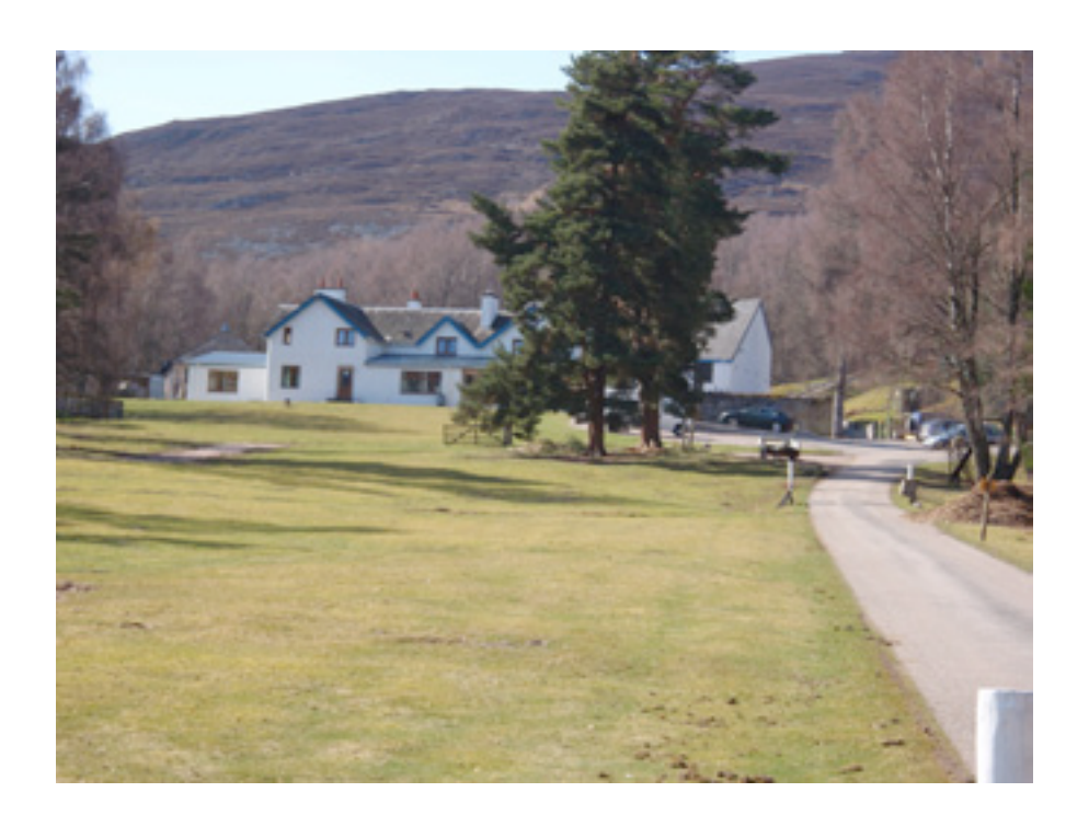
Fig 2 Photo showing the Outdoor Activity Centre

I. Planning permission is being sought in this application for the erection of four houses for staff accommodation for Scripture Union Scotland who own and run a residential activity centre at Alltnacriche. The centre is located approximately three miles southwest of Aviemore. The centre is set in 17 acres of grounds which is a mixture of parkland and woodland comprising of silver birch and scots pine. Access to the residential activity centre is taken from the A9 with the residential activity centre located approximately Ikm from the road accessed by a single track road which follows the burn. Planning permission was granted in 1994 for a manager's house which is located to the north of the Outdoor Activity Centre. The applicants have stated that they now require additional staff accommodation and have submitted supporting information to make the case as to why this additional accommodation is necessary.