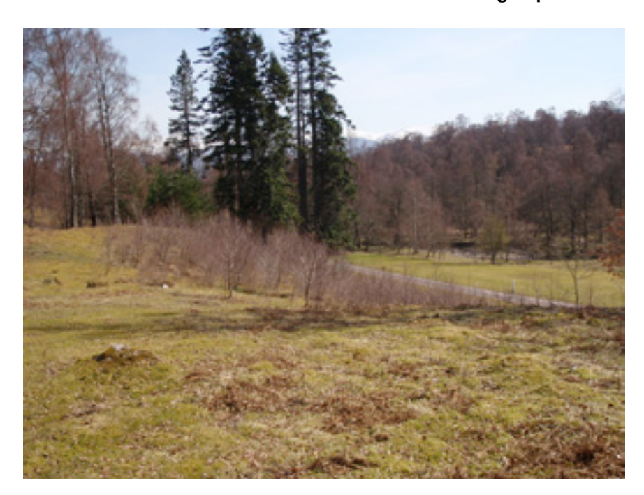
Fig 3 Photo taken from plateau on the application site