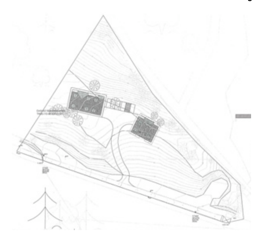
Fig 5 showing original proposed layout plan (1 x 3 unit, 1 x 2 unit)