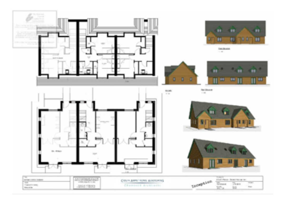
Fig 6 The originally proposed 3 unit block